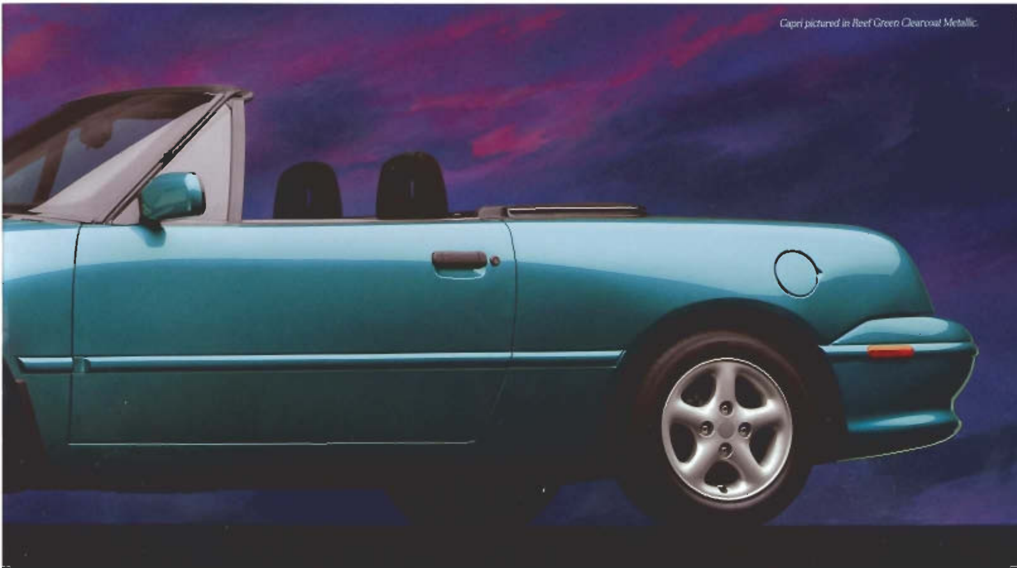
Capri pictured in Reef Green Clearcoat Metallic.