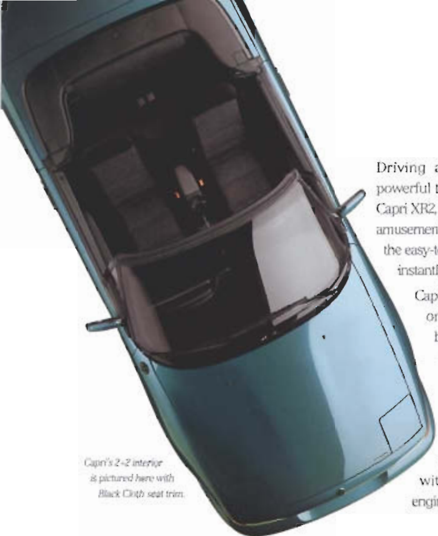
Capri's 2+2 interior is pictured here with Black Cloth seat trim.