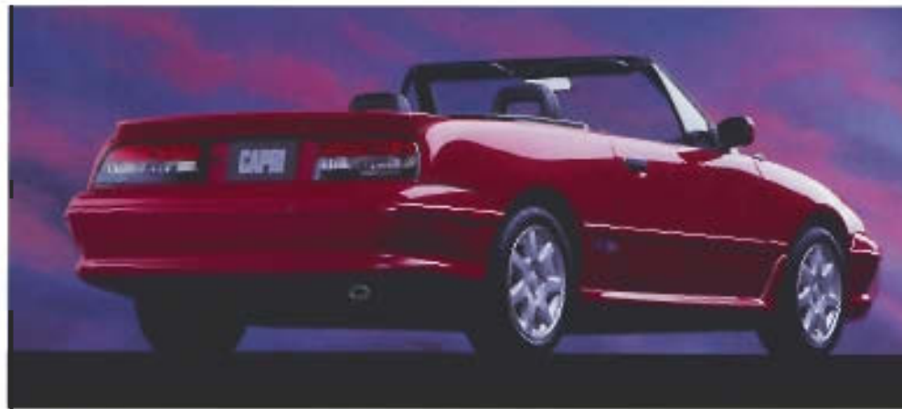
Capri XR2 pictured in Magenta Clearcoat.

1. Capri provides added reassurance for both driver and front passenger with a standard dual air bag Supplemental Restraint System. Of course, it can't properly perform its vital task